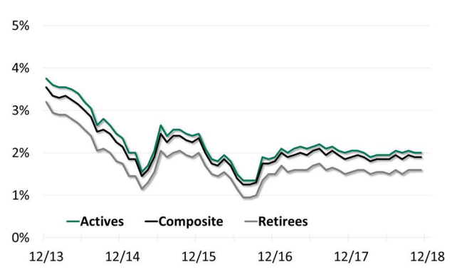
Historical Discount Rates

The discount rate development of the past four years is shown in the following chart: